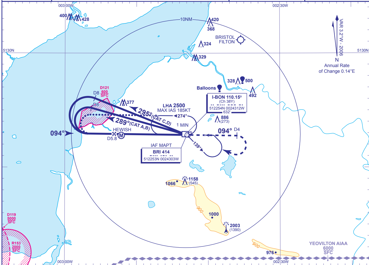
RECOMMENDED PROFILE Gradient 5.2%, 320FT/NM